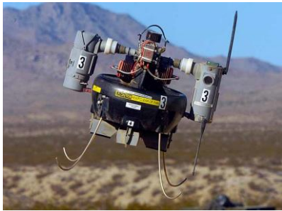
Figure 3 – T-Hawk UAV

The main disadvantage of small UAVs when using them as means of atmospheric and radiation control is the short time of operation in the zone of local pollution, therefore, monitoring flights must be organized and conducted according to a predetermined method, with the determination of the time and routes of UAV tracking.