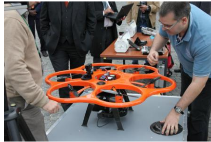
Figure 4 – Sexticopter of the IAEA