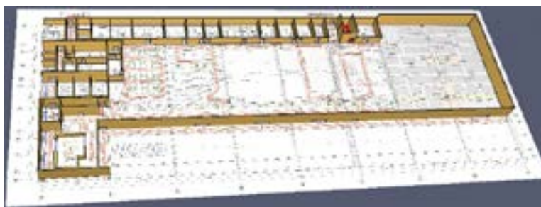
Figure 1 - Room model for simulation of the dynamics of fire hazards

Scenario No. 2. The initial conditions of scenario No. 2 are the same as for scenario No. 1, namely the centre of the fire is located in the switchboard near the evacuation exit, trampoline and the area of iXbox machine, and there is a maze nearby. Scenario No. 2 differs in taking into account the probability that visitors (according to statistical studies) are evacuated the way they entered a particular room.