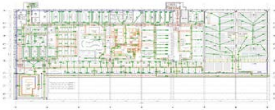
Figure 4 - Schematic of evacuation routes