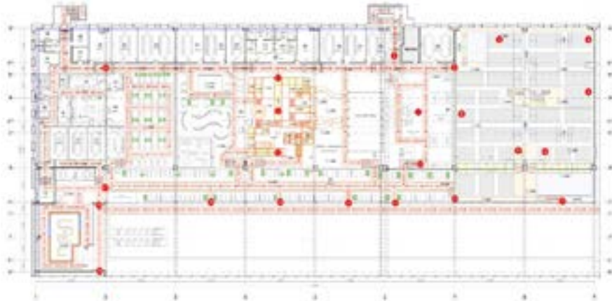
Figure 2 - Schematic of the room and location of sensors measuring indicators of fire hazards